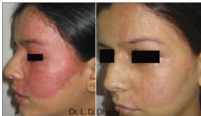
Figure 3: PWS before and after 6 treatments with PDL 595 nm

The approach to the treatment depends on location of pigment (epidermal, dermal or mixed), the way it is packaged (intracellular or extracellular) and the nature of pigment (melanin or tattoo particle). Continuous wave lasers like CO 2 (10,600 nm) or Er-YAG (2940 nm) with water as a target chromophore in epidermis can be used for removing the superficial pigmented skin, especially seborrheic keratosis and 'Q-switched resistant' Café-Au-Lait macules. But the non selective thermal injury may lead to some erythema and possible pigmentary and textural changes. In many pigmented lesions however, the melanosomes and melanocytes are clustered so compactly that they act as a larger body of chromophore. In this situation, melanin specific wavelengths even in millisecond domain also lead to lesion clearance. These long pulsed lasers are only suitable to treat nevocellular