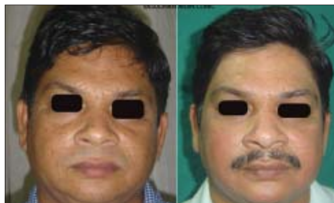
Figure 14: (A) Small pox scars (B) After combined derm abrasion and Er:YAG 2940 nm laser resurfacing in a single sitting

Ablative laser resurfacing leads to dramatic improvement in the overall quality of skin. The gains can be up to 50% or more, including reduction of wrinkles, levelling of deep scars and vaporisation of superficial skin lesions [Figure 14]. Unacceptable down time of this procedure led to the development of a promising non-ablative resurfacing technique, which is now in the forefront.