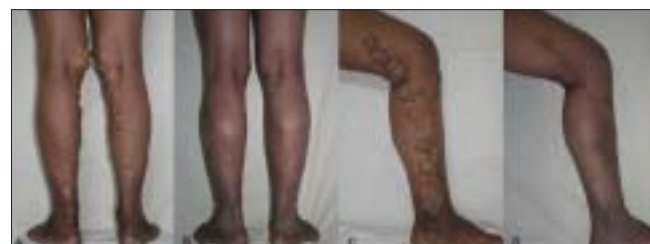
Figure 16: Varicose veins before and after EndoVenous Laser ablation with Diode 980 nm