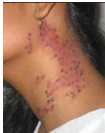
Figure 18: Purpuric spots after PDL 595 nm treatment of PWS. Usually they clear in a 5 to 7 days period

The efficacy of this laser has been demonstrated by histologicalevidence,photographyandclinical satisfaction with tighter, firmer and more toned skin. This occurs as a result of increase in the number of fibroblasts, increased