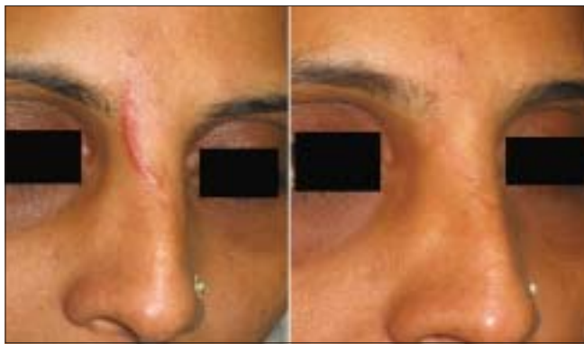
Figure 7: Post traumatic hypertrophic scar before and after 1 PDL and 4 IPL treatments (590 filter.)