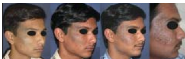
Figure 20: (A) Congenital Pigmented Nevus. Greenish hue indicates more deeper pigment (B) Clearing well with QS Nd:YAG 1064 nm laser (3 treatments). (C) Hypo-pigmentation appeared after 7 th treatment (D) Mottling increased with subsequent treatments and has persisted 3½ months after 12 th treatment