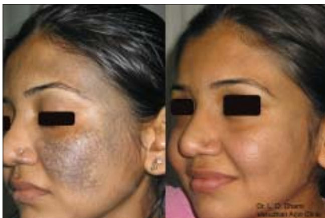
Figure 11: Nevus of Ota before and after Q-Switched Nd:YAG 1064 nm laser treatments. Please note the complete clearance of the pigment without any residual textural skin change.

nevi while IPL (500 nm to 1200 nm) treats photo damaged pigmentations like solar lentigines, dyschromia and melasma [Figures 9,10].