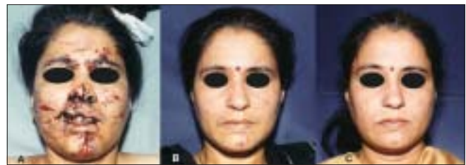
Figure 8: (A) Extensive windshield injury of face. (B) Result after primary plastic surgical repair. (C) Result after 4 IPL treatments (590 filter) at monthly interval

The Q-Switched Lasers (532 nm FD 694 nm Ruby, 755 nm Alexandrite or 1064 nm Nd-YAG) with their high peak power and pulse width in nano second range are best suited to treat various epidermal, junctional, mixed and dermal lesions The Q-switched Nd-YAG is an ideal choice to treat dermal pigment as in nevus of Ota and in darker skin types, as it reduces the risk of epidermal injury and pigmentary alterations. The pigment clearance may be