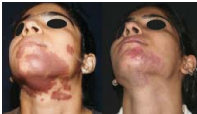
Figure 4: PWS before and after 10 treatments of IPL with 590 nm filter