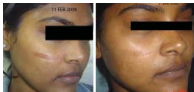
Figure 15: Spread and Atrophic ARSTL scar dramatically improved with Matisse TM (12) Fractional 1540 nm Erbium: glass laser non-ablative resurfacing

stronger water absorption and reduced deeper thermal damage came as an advancement. But though Er:YAG laser was very good for skin lightening and levelling, the tissue tightening effect was much less than with CO 2 . Increasing the pulse width increased the residual thermal damage providing additional benefit but also increased side effects. The next development came as a laser that combined Erbium with CO 2 . Erbium provided pure ablation, while CO 2 allowed heat deposition for skin tightening. Use of topical anaesthetics, which hydrated the skin also helped minimise side effects. Despite all these advances, ablative lasers lead to significant down time of few weeks to months. The common side effects seen often are erythema, oedema, infection, flare up of acne, hyper pigmentation, relative hypo pigmentation and scarring. The true contraindications are history of vitiligo, scleroderma, darker skin patients, and unrealistic expectations.