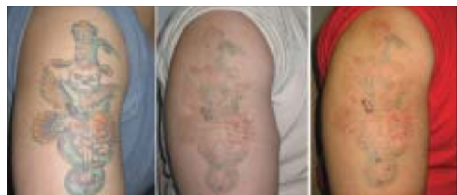
Figure 12: Multicolored tattoo treated with 4 simultaneous treatments with Q-Switched 1064 nm (for black and green) and 532 nm (for red). Small hypertrophic scar is pre-existing

expected to be near total [Figure 11]. In case of tattoos however, no other laser technique is found to be more effective than Q-switching. In a multicolored tattoo for black ink QS 1064 nm, QS 755 nm and QS 694 nm are excellent. For red ink FDQS 532 nm is excellent. For green ink QS 755 nm, QS 694 nm and QS 1064 nm are found to work in that order. [Figure 12]. In India most commonly done tattoos are amateur and religious using carbon which clears very well with 1064 nm. [Figure 13]