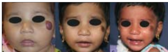
Figure 19: (A) Haemangioma over left cheek. (B) Hyper pigmentation following 5 Nd:YAG 1064 nm laser treatments. A single treatment with Q-Switched Nd:YAG overcame parental anxiety. (C) Pigment clearing after 2 months

specific concerns. If the vascular element is the main concern then PDL or an IPL with 590 nm filter would be most suitable. If pigment disorder is the main issue then IPL with 645 nm filter or near infra red laser of 1064 nm Nd:YAG would provide the best improvement. The mid infra red lasers induce changes such as vascular damage, apoptosis, water vaporisation in the dermis and oedema with imperceptible wounding, which then leads to a cascade of inflammatory processes and subsequent neo-collagenesis. The laser beam in effect, penetrates up to a depth of 2 mm (papillary dermis), resulting into reduction of rhytides. The different wavelengths of 1320, 1450 and 1540 nm are all often used interchangeably with similar efficacy, though 1450 nm Diode and 1540 Erbium: glass Lasers are superior in the recontouring of atrophic scars [Figure 15] and treatment of inflammatory sebaceous glands. The field of non ablative resurfacing has expanded dramatically over last 10 years, while the ablative laser procedures have remained stagnant during this period.