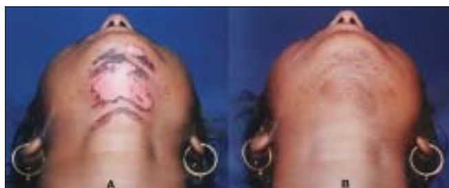
Figure 17: (A) Burns after 2nd HR treatment by IPL even with the longest 755 filter in a dark skin type. Photograph on 3rd day. This was a result of neglecting a warning in the form of a few very superficial brownish marks after 1st treatment with the same filter. In such a threshold situation, subsequent fluence should be decreased. Here it was rather increased by just 2 J/cm 2 (B) Two months later hyper pigmentation has persisted. This acts as a hindrance to further treatments

The wide array of non ablative rejuvenation lasers allow us to individualise treatment based on the patient's